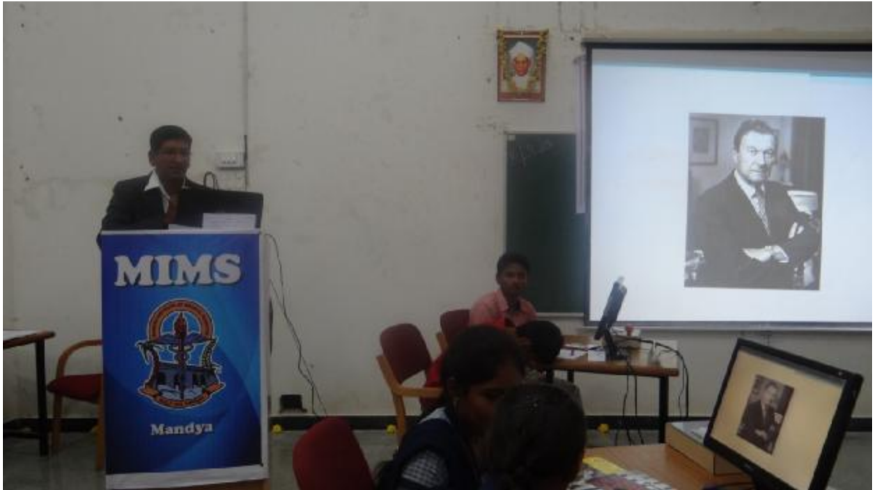
Pic 2 : The visual round of the quiz in progress

The second place and the third place were won by Abhinava Bharathi PU college boys' team and girls' team respectively.