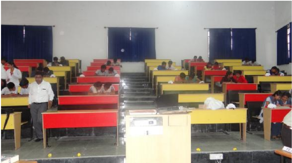
Pic 1 : The teams participating in the preliminary round of the quiz

There are 35 Pre-university colleges in Mandya. 15 institutions had sent a team of 2 students each to the competition. A preliminary round was conducted to select four teams out of the 15 teams which had participated.