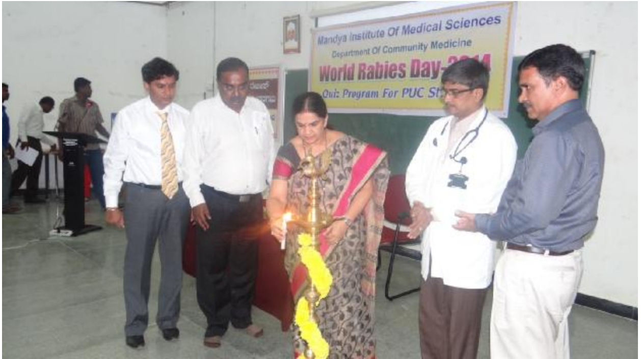
Pic 1 : The dignitaries lighting the lamp